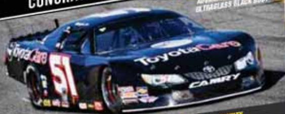
CHRISTOPHER BELL CARS 150 - ORANGE COUNTY