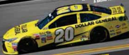
MATT KENSETH NASCAR SPRINT CUP - BRISTOL