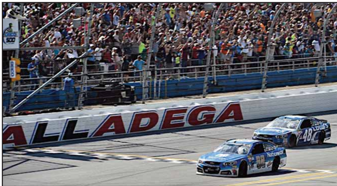
Teammates Dale Earnhardt Jr. (88) and Jimmie Johnson (48) finish the Geico 500 first and second at Talladega Superspeedway Sunday afternoon.

However, the show in the final laps belonged to his Hendrick teammates, Earnhardt and Johnson.