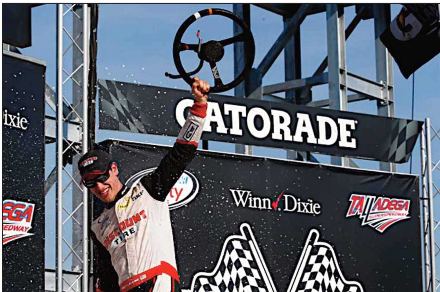
Joey Logano celebrates in Talladega Speedway's victory lane after winning the Winn-Dixie 300.