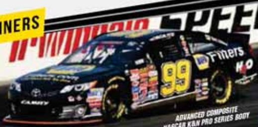
CHRIS EGGLESTON NASCAR K&N PRO SERIES WEST - IRVINDALE