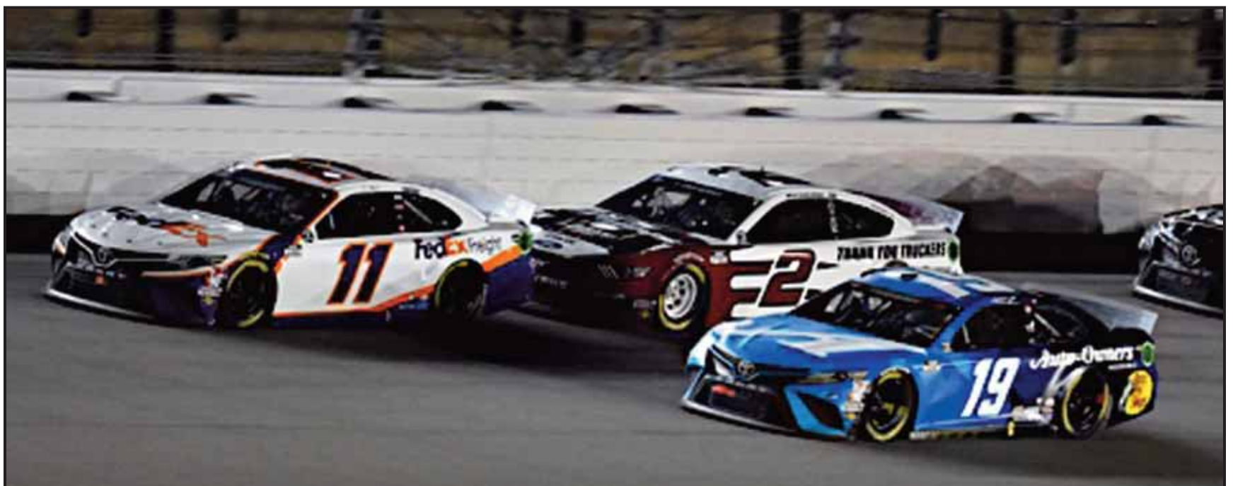
Denny Hamlin (11) battles to keep the lead over Brad Keselowski (2) and Martin Truex Jr. (19) to finish in the winning position Thursday night.

Harvick held the fourth position at the finish. Erik Jones ran fifth, followed by Aric Almirola (scoring his eighth straight top 10), Cole Custer, Bowman, Kurt Busch and Byron. In the race for the regular-season championship, Harvick leads second-place Keselowski by 97 points.