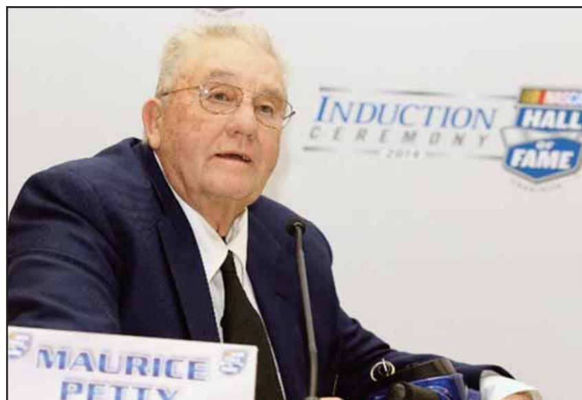
Maurice Petty, Hall of Fame engine builder and brother to Richard Petty passed away Saturday at the age of 81.

Maurice was the crew chief for Pete Hamilton for the 1970 DAYTONA 500 and the Talladega (Ala.) Superspeedway victories. As a driver, Maurice has 26 NASCAR Cup Series starts with seven top-five and 16 top-10 finishes between 1960 and 1964.