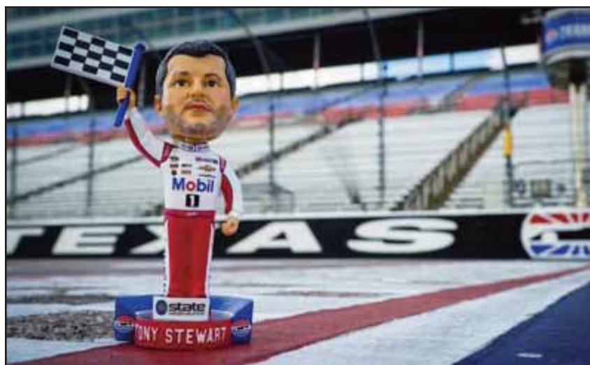
Texas Motor Speedway will be giving away a limited edition bobble-head of Tony Stewart to the first 30,000 fans on Sunday Nov. 6th.

Stewart has also been a major contributor to Speedway Children's Charities-Texas Chapter through his work as host of the Tony Stewart "Smoke Show" Fantasy Camp. The "Smoke Show" has raised