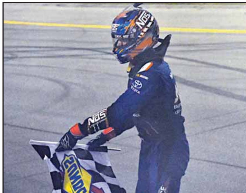
With his signature saluting the fans, Kyle Busch waves his checkered flag after winning Friday night at RIR.

"We worked on it there at the start of the race. We were really out of control and loose, and I got to fourth, I thought that was kind where we were going to be. But my guys had an awesome pit stop, got