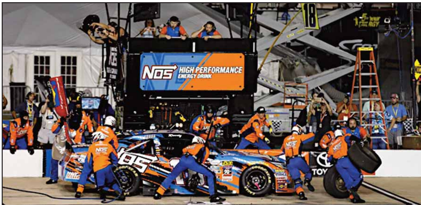
With a pit stop giving him the lead, Kyle Busch took that lead and went on to win the Virginia529 College Savings 250 at Richmond International Raceway.

Ryan Reed, the last driver to finish on the lead lap, clinched a spot in the inaugural XFINITY Series Chase with an 11th-place run, leaving two berths still open heading to the Sept. 17 cutoff race at Chicagoland Speedway.