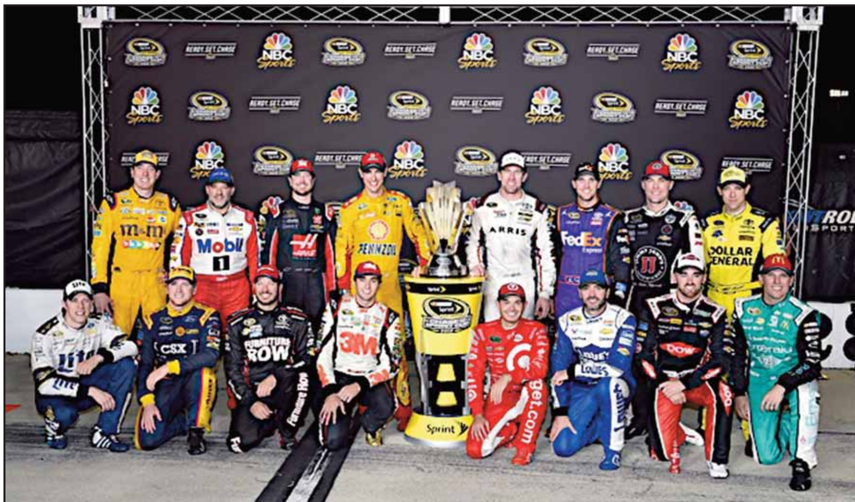
The Chase players: Top row, left to right - Kyle Busch, Tony Stewart, Kurt Busch, Joey Logano, Carl Edwards, Denny Hamlin, Kevin Harvick and Matt Kenseth. Bottom row, left to right - Brad Keselowski, Chris Buescher, Martin Truex, Jr., Chase Elliott, Kyle Larson, Jimmie Johnson, Austin Dillon and Jamie McMurray pose with the coveted NASCAR Sprint Cup Series trophy at RIR.