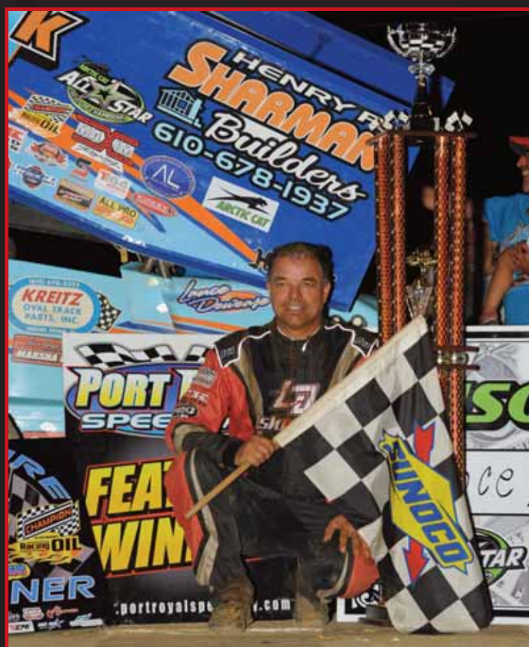
Lance Dewease Dominates at Port Royal Speedway