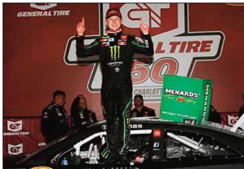
Ty Gibbs celebrates in victory lane after winning the ARCA Series General Tire 150 at Charlotte Motor Speedway. Gibbs won the Xfinity race earlier in the day at the speedway.

throughout Saturday night's race appeared to be the only driver who could compete with Gibbs, finished fifth.