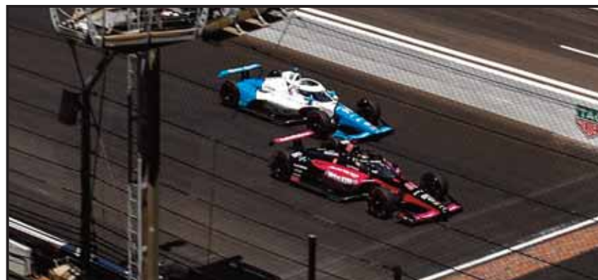
Helio Castroneves holds the lead to win the Indianapolis 500 for the fourth time.

One day later, Castroneves would join this elite group when he captured his fourth Indy 500. The