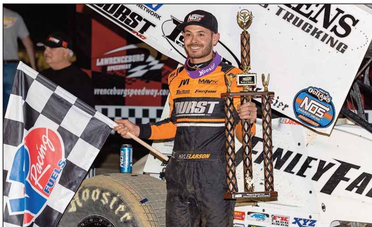
Kyle Larson celebrates his 21st career World of Outlaws win in victory lane at Lawrenceburg Speedway 24 hours after winning the Coca-Cola 600 at Charlotte Motor Speedway 500 miles away.

For fans who have already purchased tickets to Friday’s show at Terre Haute, you can use those tickets for the rescheduled date. Once the new date is announced, those unable to make it to the rescheduled date will have the opportunity to request a refund.