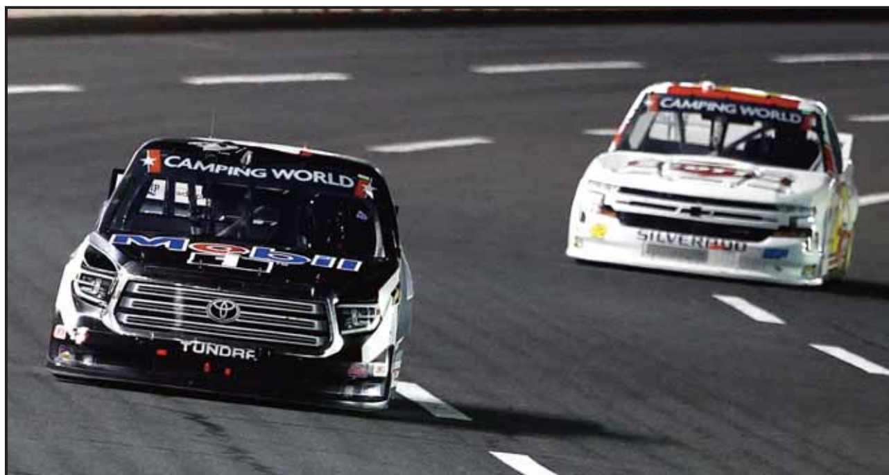
John Hunter Nemechek (4) battles Carson Hocevar (47) to keep the lead and win the race.

The Camping World Truck Series Playoffs get underway at World Wide Technology Raceway on Friday, Aug. 20 at 9 p.m. ET on FS1, MRN and SiriusXM NASCAR Radio.