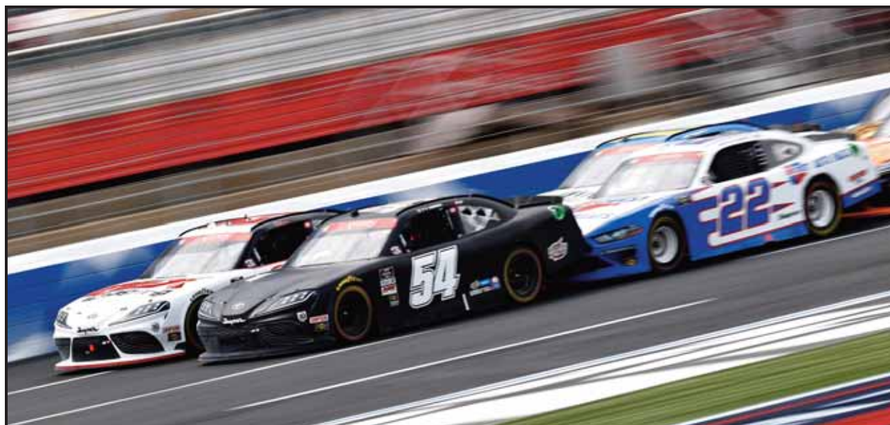
Ty Gibbs (54) gets a shove from Austin Cindric during a restart.

Cindric, the reigning series champion, now leads the standings by 84 points over second-place Harrison Burton.