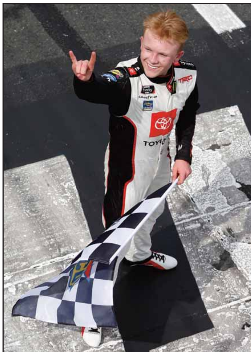
Xfinity race winner Ty Gibbs sends love to the fans after battling to the checkered flag at Charlotte Motor Speedway Saturday.

Seeking his first victory in his 99th start in the series, Daniel Hemric swept the first two stages, but a pit road mistake cost him dearly. During a pit stop under the sixth caution on Lap 121 of 200, Hemric was blocked by the Toyota