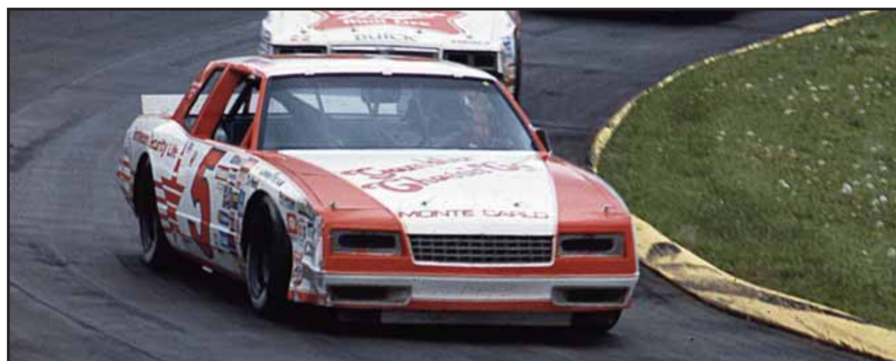
Geoff Bodine takes the #5 Hendrick Motorsports to it's first victory at Martinsville Speedway 37 years ago.

cars and the Ford driven by Joey Logano. His interest in Logano is linked to his involvement in Bodine's nonprofit bobsled company, Bo-Dyn Bobsled Project that provides sled to the U.S. teams and Skelton Federation.