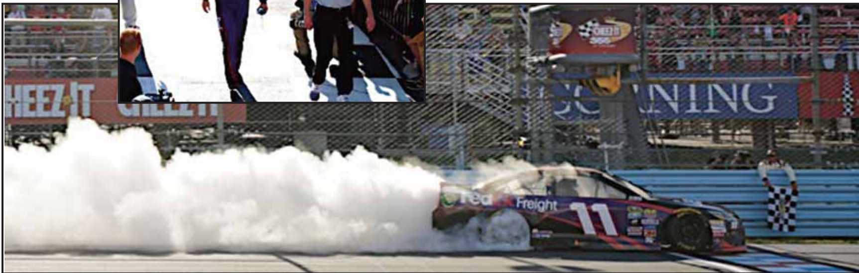
Race winner Denny Hamlin literally burnt the tires off of his #11 FedEx Toyota after crossing the finish line in the Cheez-It 355 at Watkins Glen International and had to walk to victory lane while the crew put new tires on his racer.