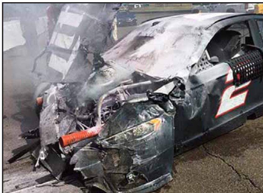
Keselowski tweeted that he lost his brakes entering the corner off the long frontstretch during a test at the Glen.

Ragan crashed hard on the final lap at Watkins Glen in 2011. Ragan was forced off the track and into a concrete wall. His car came back on the track and struck Reutimann. The collision sent Reutimann on his roof and into a steel barrier. Both miraculously walked away without serious injury.