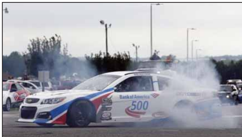
NASCAR driver Clint Bowyer smokes his tires during a burnout at Charlotte Motor Speedway's Parade of Power on Wednesday.