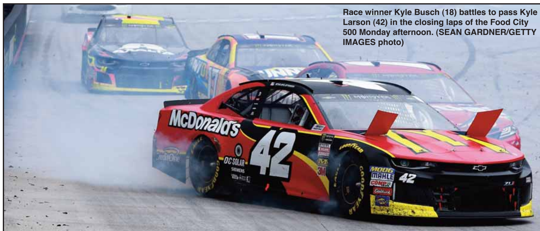
Race winner Kyle Busch (18) battles to pass Kyle Larson (42) in the closing laps of the Food City 500 Monday afternoon.

Busch expanded his series lead to 59 points over second-place Logano. Monday marked the first time a series leader had won at Bristol since Dale Earnhardt accomplished the feat in 1987, when he swept both Bristol races as the points leader.