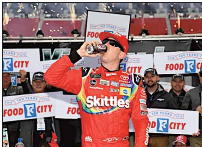
Kyle Busch gets some refreshment after winning the Food City 500 on rain-delay Monday at Bristol Motor Speedway.

“I knew I might as well just take the opportunity that I got right now. I knew it was a little early ‘cause you tend to try to want to think about saving that bump-and-run deal for the last lap, but I just took