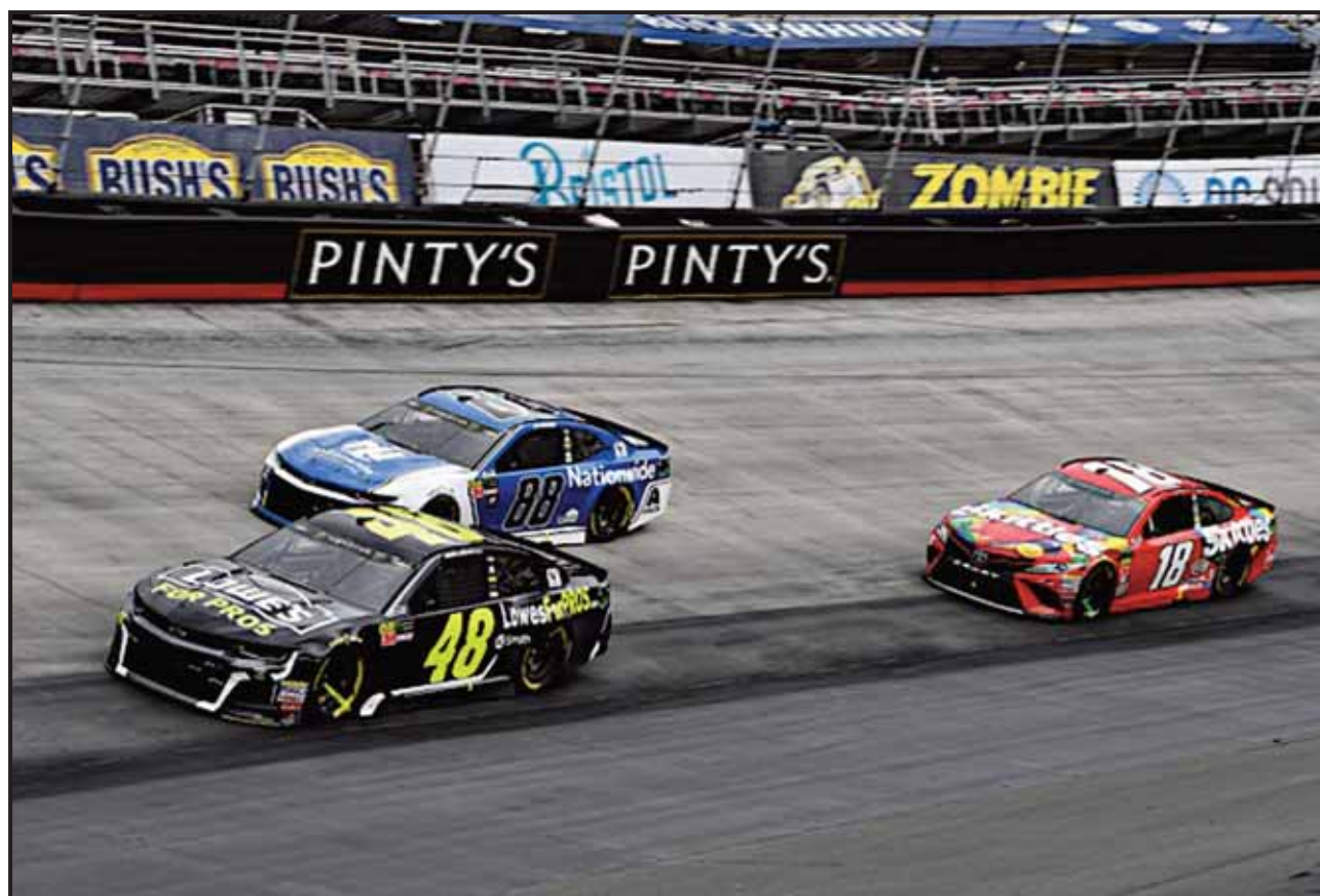
Jimmie Johnson (48) and Alex Bowman (88) race hard to hold off a charging race winner Kyle Busch (18) to end the race in third and fifth place respectively.