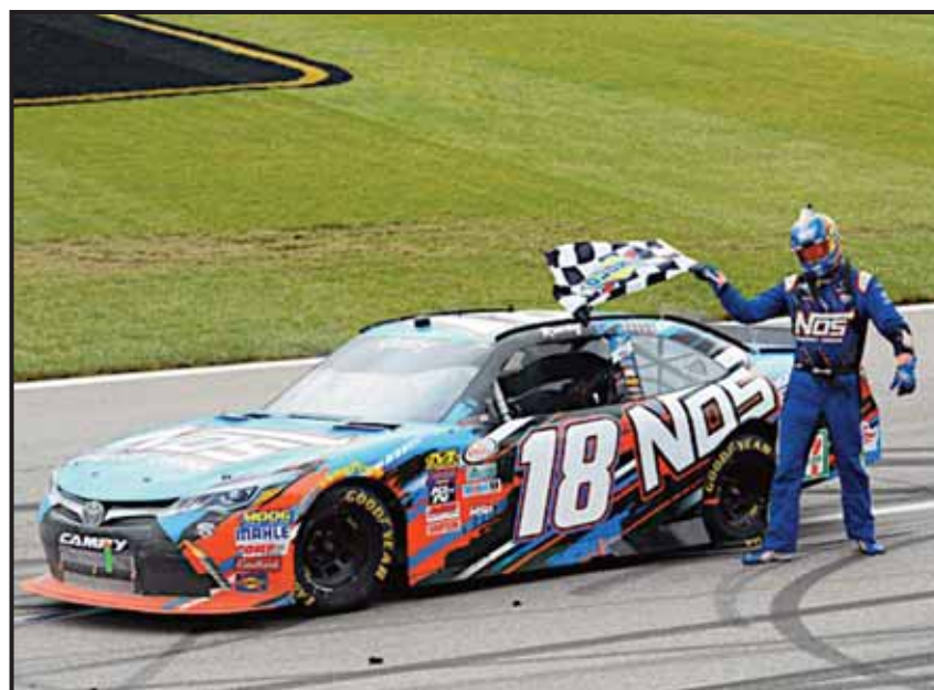
Race winner Kyle Busch celebrates on the track at Kansas Speedway after dominating the Kansas Lottery 300.

Chaos gobbled up the remaining five Chase contenders. A tap from Brandon Jones turned Chaser Justin Allgaier sideways and ignited a six-car wreck that also eliminated Darrell Wallace Jr., who crashed out in 33rd-place. In a severely