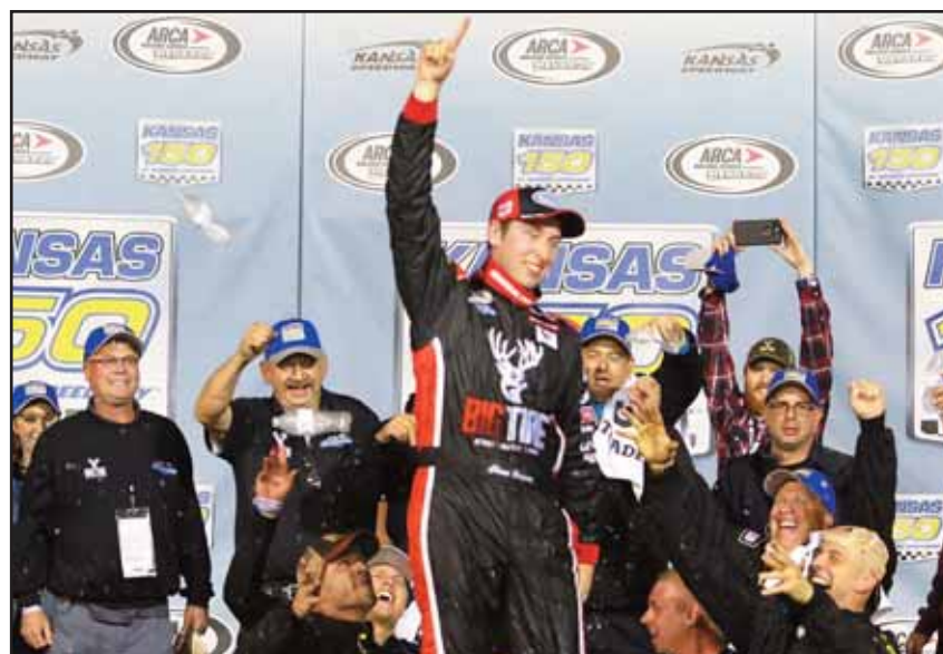
Chase Briscoe celebrates his win at Kansas Speedway in victory lane. This win clinched the 2016 Championship for Briscoe and his crew.