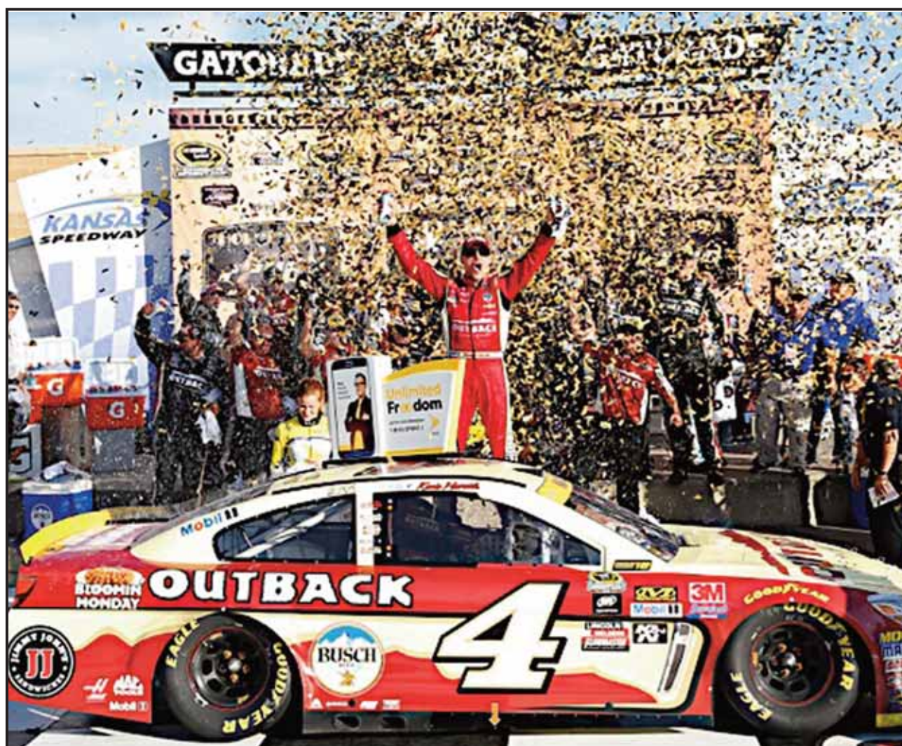
Happy Harvick lives up to his name and his reputation of pulling off a win when needed. Here the race winner celebrates in Kansas Speedway's victory lane after passing Carl Edwards after the last restart to take the Hollywood Casino 400.

"I want to race my guts out and go for wins. I don't want to points-race. I don't care what the damn format is—I'm going to give it my best."