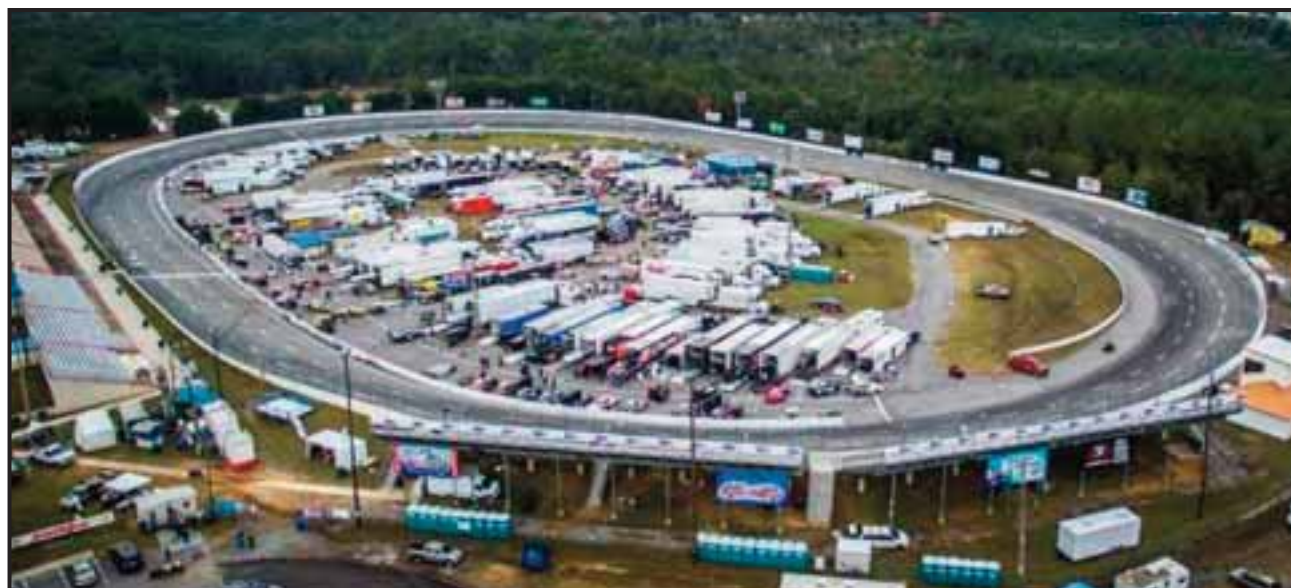
Aerial look at Five Flags Speedway.