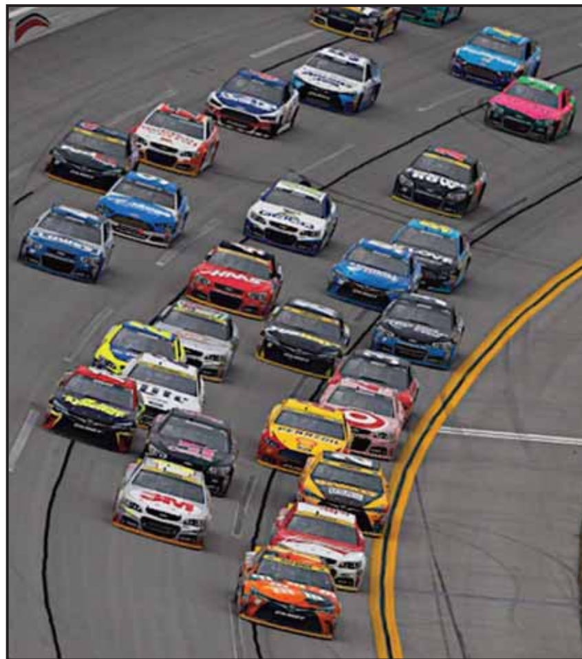
It is not so much if there will be a "big" one, but when will it happen with such close, fast and competitive racing that happens at Talladega Superspeedway.

Everyone else will go to Talladega holding their breath, hoping for the best, but expecting the worst.