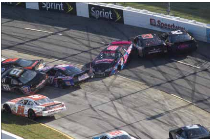
Several cars pile up during one of 13 cautions during the ValleyStar Credit Union 300 at Martinsville Speedway.