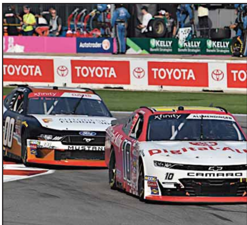
A. J. Allmendinger (10) battles with Cole Custer (00) through the turns on the Charlotte Roval Saturday afternoon.

Nemechek is 11 points behind Michael Annett in eighth place, tied with Brandon Jones (16th Saturday). Ryan Sieg finished 30th after suffering fuel pressure issues and enters the Dover race 37 points below the cut line. Justin Haley, Allmendinger's Kaulig Racing teammate broke a track bar mount early in the race and finished 31st, six laps down and 39 points behind Annett.