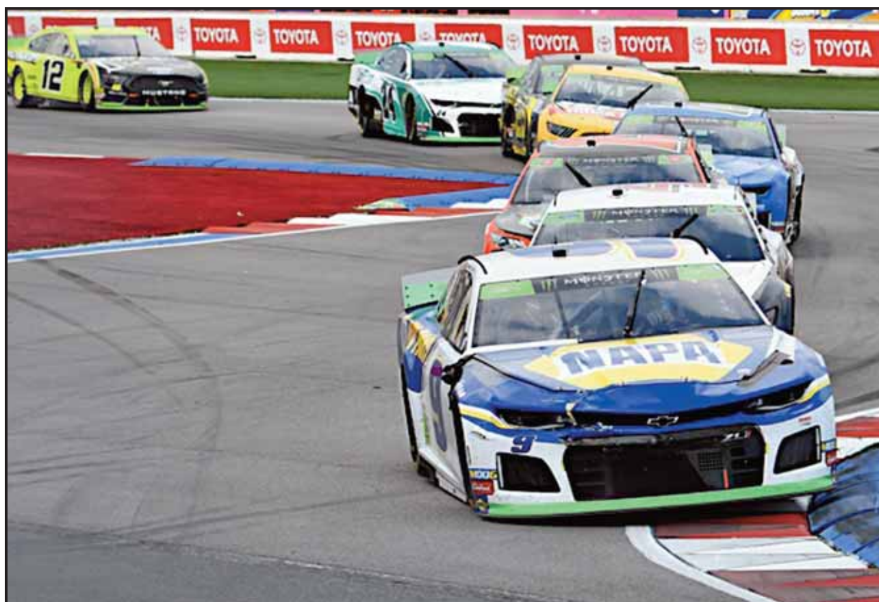
After leading the race, wrecking, and repairing his race car, Chase Elliott (9) works his way back to the front of the pack by passing Kevin Harvick (4) and leading the field through the turns. (

Harvick finished third in the Roval 400, followed by Bowyer, Keselowski, Truex and Blaney, who gritted out his eighth-place finish after damaging the rear suspension after hitting the wall.