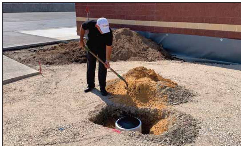
Officials at Dover International Speedway buried a time capsule in celebration of the track's 50th Anniversary season.

The Oct. 4-6 NASCAR tripleheader weekend also includes the "Use Your Melon Drive Sober 200"